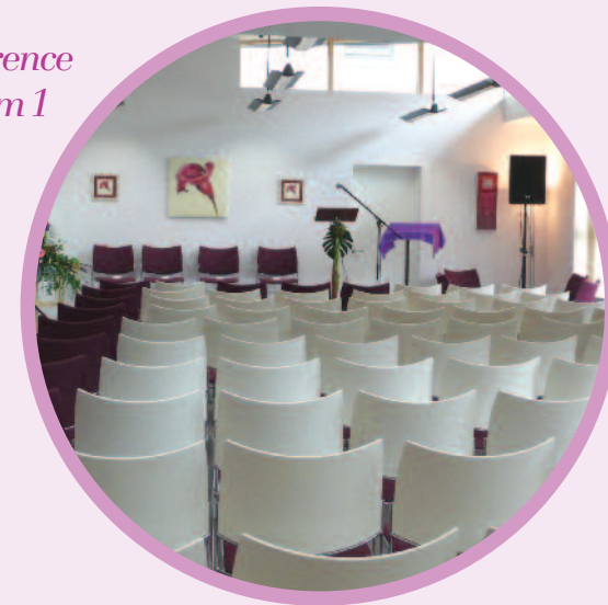
Conference Room 1